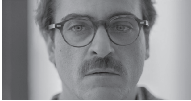
Figure 1. First shot of Theodore in Her (Annapurna Pictures, 2013).