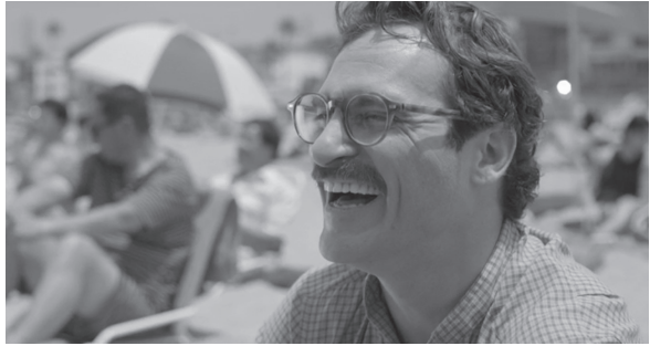
Figure 6. Theodore on the beach, speaking to and laughing with Samantha, in Her (Annapurna Pictures, 2013).

We can compare Isabella to the Fleshlight sex toy. In a way, she performs the same function as the artificial vagina. As a surrogate sexual partner for Theodore, she is not a real partner. But neither is she a partial object. She is objectified for the bodily component that she will play in the sexual relationship between Theodore and