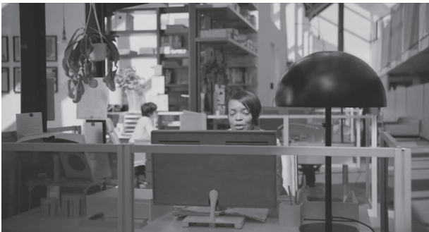
19 Figure 5. Theodore’s coworkers in their cubicles at BeautifulHandwritten Letters.com, in Her (Annapurna Pictures, 2013).

kind of labor “(im) material labor,” to preserve both its material and its immaterial components.