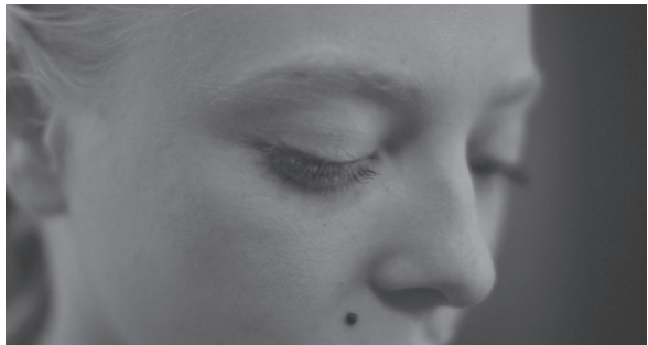
Figures 7 and 8. Isabella arrives at Theodore’s apartment and puts on the fake-mole camera, in Her (Annapurna Pictures, 2013).

1 2 3 4 5 6 7 8 9 10 11 12 13 14 15 16 17 18 19 20 21 22 23 24 25 26 27 28 29 30 31 32 33 34 35 36 37 38 39 40 41 42 43 44 45