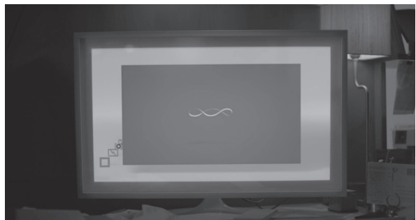
Figure 4. The avatar for OS system as it is booting up, in Her (Annapurna Pictures, 2013).

1 2 3 4 5 6 7 8 9 10 11 12 13 14 15 16 17 18 19 20 21 22 23 24 25 26 27 28 29 30 31 32 33 34 35 36 37 38 39 40 41 42 43 44 45