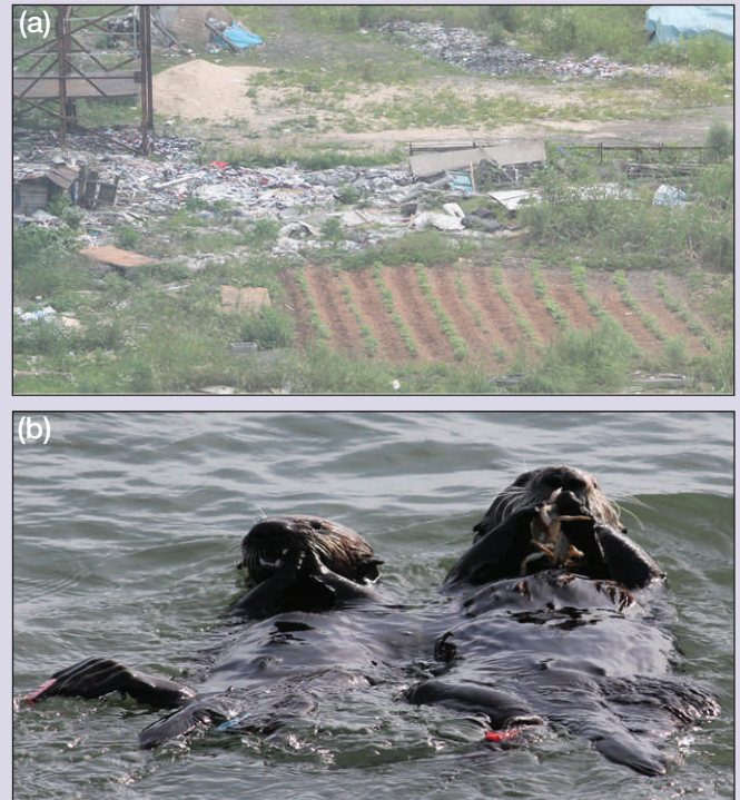
Figure 3. (a) Vegetables grown next to heaps of waste in a city in Liaoning province, China. Improved sanitation can reduce risk of intestinal infection due to contaminated food and water. (b) Sea otters ( Enhydra lutris ) forage near the shoreline in Monterey Bay, CA. Otters closer to human-occupied coastlines have higher infection prevalence of Toxoplasma gondii and Sarcocystis neurona .

Once human pathogens have reached the Established stage, efforts to reduce spatial spread are abandoned and focus shifts to reducing the transmission and severity of disease. One way of reducing transmission of food- and water-borne pathogens such as cholera, Escherichia coli , leptospirosis, and typhoid is through improved sanitation (Ashbolt 2004). For wildlife, improved sanitation of terrestrial environments may reduce transmission of terrestrial pathogens to marine ecosystems (Figure 3). Sea otters foraging near human-dominated coastlines are at higher risk of infection with two pathogens – Toxoplasma gondii and Sarcocystis neurona , both shed by human commensal species (cats and opossums, respectively) – than those foraging on higher quality prey items that may be present in higher abundance in areas farther from human development (Johnson et al. 2009). Managing human and wildlife disease requires an adaptive approach that addresses the unique attributes of each group of hosts and pathogens.