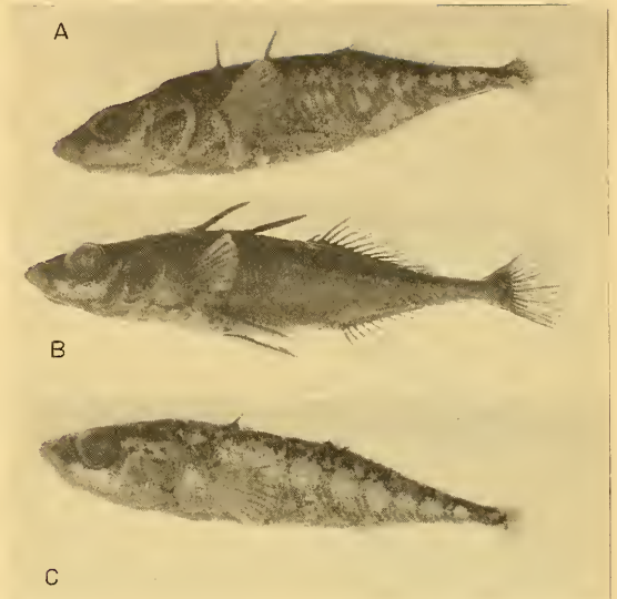
FIGURE 1. Gasterosteus from the Queen Charlotte Islands. (A) Leiurus from Woodpile Creek, in the Mayer Lake drainage, approximately 55 mm standard length; (B) "Black" specimen from Mayer Lake, approximately 70 mm standard length; (C) specimen from Boulton Lake lacking the second dorsal spine and both pelvic spines, approximately 50 mm standard length.

Although G. aculeatus is a variable species, generally the freshwater form known as leiurus (Figure 1A) is a thick bodied fish with three dorsal spines and one pair of ventral spines forming the major part of the pelvic fins. They lack scales but there is a series of lateral bony plates. The number of these plates usually ranges from four to 35 but the average in fresh water is about five to 10. The body color is pale yellow with irregular patches and stripes of olive and brown. For a detailed description of eastern Pacific coast sticklebacks and their variation, papers by Hagen (1967) and Hagen and Gilbertson (1972) should be consulted.