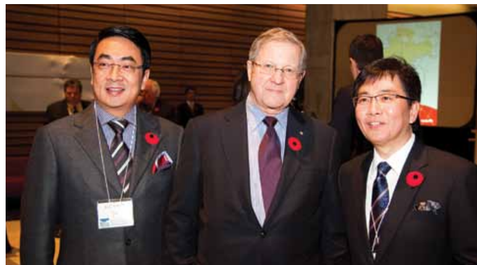
Dr. Lloyd Axworthy with members of the Chinese delegation