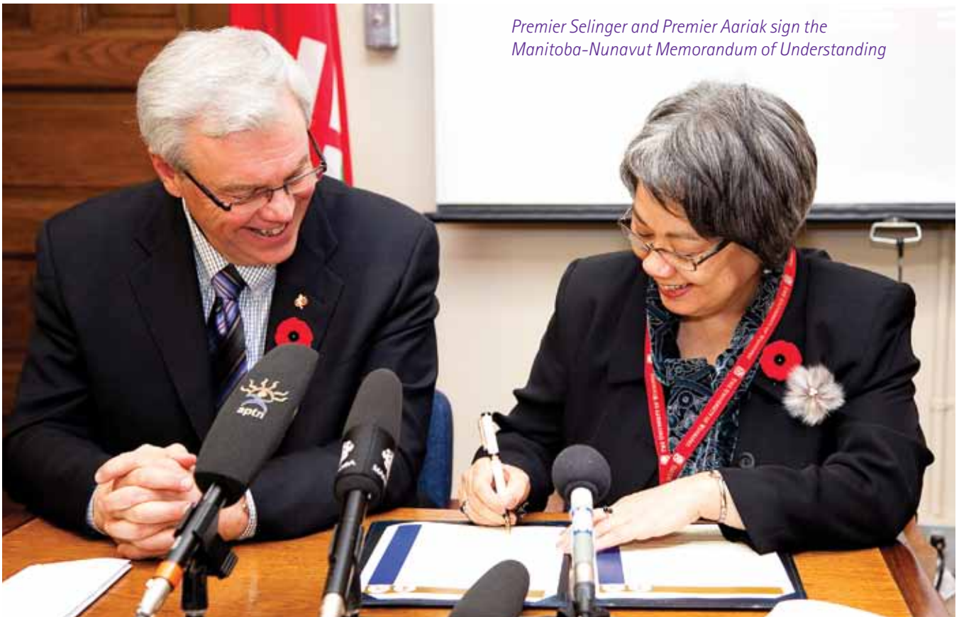
Premier Selinger and Premier Aariak sign the Manitoba-Nunavut Memorandum of Understanding