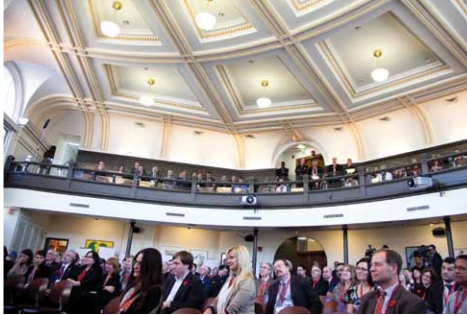
Summit participants at the opening plenary

In the evening, a reception was held at Manitoba Hydro Place, allowing participants and international guests to network with local business leaders from Winnipeg, representatives from Manitoba communities and the Aboriginal Chambers of Commerce.