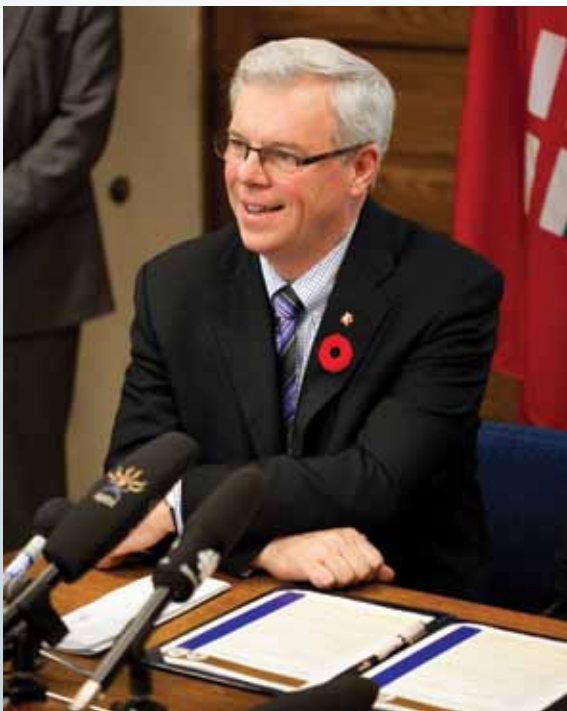
Premier Selinger speaks to the media

It also had an impact on the Hudson Bay Awareness Summit (November 2011 – Iqaluit), which will further explore the issues of ecological sustainability and Arctic leadership.