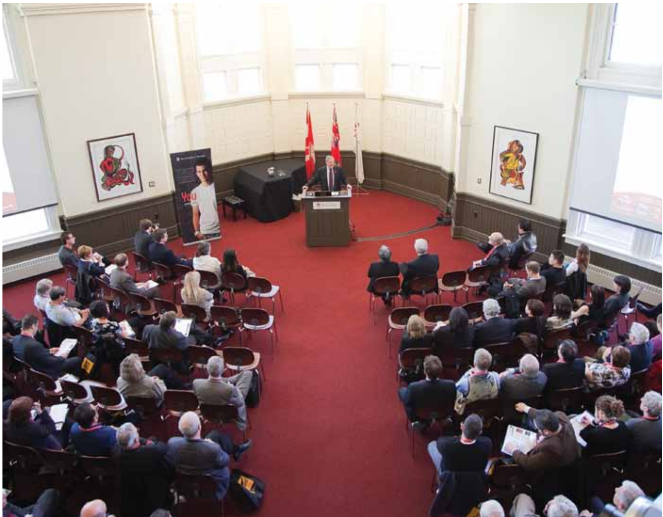
The closing plenary