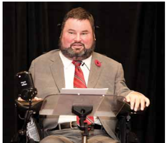
Honourable Steven Fletcher

Participants were then invited to the Winnipeg Art Gallery to view the world's largest and most spectacular collection of Inuit art.