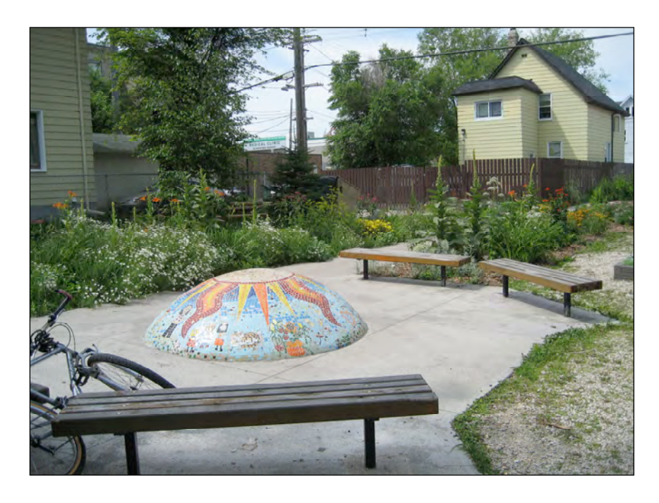
Mosaic dome.

Spirit Park Community Garden is not only a beautiful green space, but a place of special significance to many, where anyone can enjoy the beauty of the garden and find peace or serenity, whether they are gardening or not (Grant 2008). Spirit Park Community Garden has become an important and integral part of the West Broadway Neighbourhood.