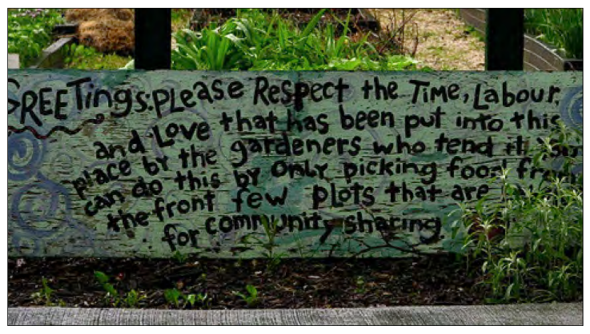
Spirit Park Community Garden sign.