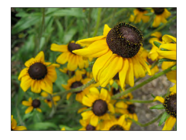
Flowers in Spirit Park Community Garden.