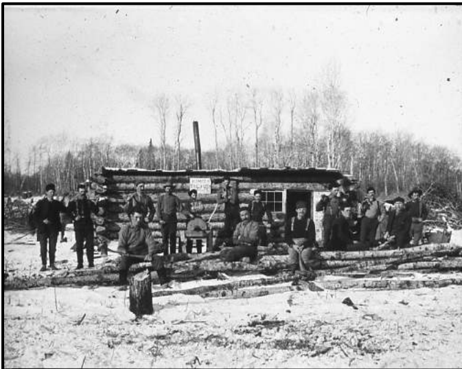
Figure 6: UW Archives Photograph n.d. Photographer unknown. Lumberman's Home in the Bush, South of Caraberry, MB

The University of Winnipeg Archives displayed eight photographs at the symposium, exploring the interplay between humans, technology, and Manitoba's forests. Taken between 1910 and 1960, the photographs provided snapshots into the lives of the people who made forests their work and home, and show the vulnerability, danger, and beauty of Manitoba's forests.