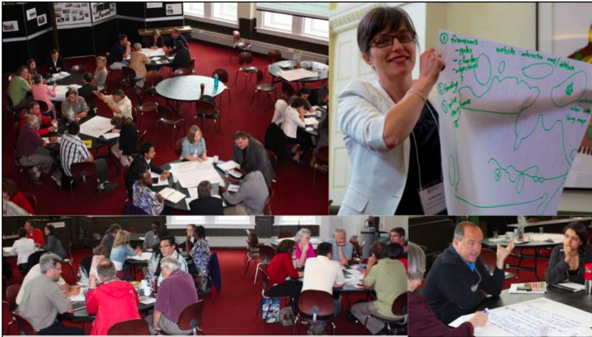
Figure 4: Session 4 breakout groups