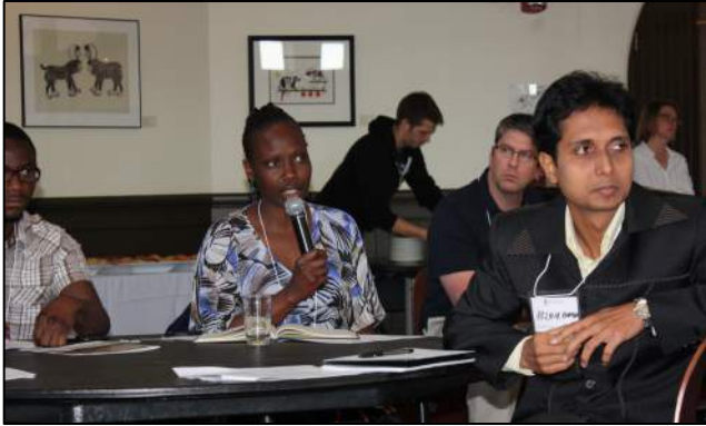
Figure 3: Panel Discussion Question Period

with First Nations. There is, therefore, a network of about 50 small community forests throughout Quebec. These community forests are not particularly well connected and there is no provincial organization, as is the case in British Columbia. Finally, Sara's presentation covered the most recent policy development, called the 'proximity forest' which was enshrined in law in 2013 but has not yet been implemented.