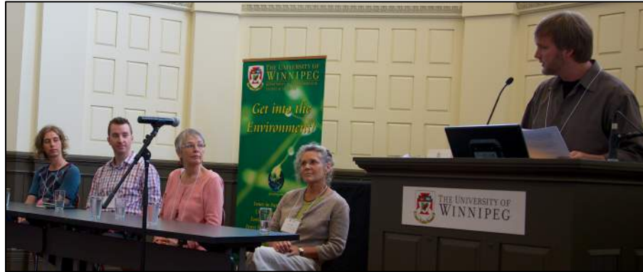
Figure 2: The Cross-Canada Updates Policy Panel, Session 1.