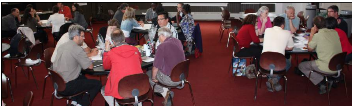
Figure 1: Group discussion at the CFCN Symposium, June 2014

A day of presentations, plenary and breakout discussions, and archival and artifact displays was designed to help explore and reframe relationships between forests and communities. This event also provided an opportunity to build new partnerships and extend the Community Forests Canada network to Manitoba in order to welcome new groups into the fold and secure collaboration. The two events connected over 50 participants from across Canada (Appendix A), who shared community forestry experiences and insights, asked questions, and worked to identify gaps and opportunities to bridge practice, research, and advocacy.