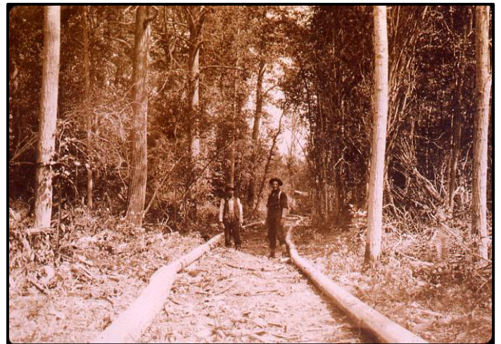
Figure 5: UW Archives Photograph n.d. Photographer unknown. Construction of Hudson Bay Railway by McDonald and Cowan Hauling Ties from the Bush. (L-R): Billie Baker, Jack Michael. Photo courtesy of T. Moody.