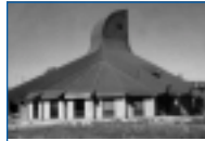
Thunder Bird House, photo Alan McTavish