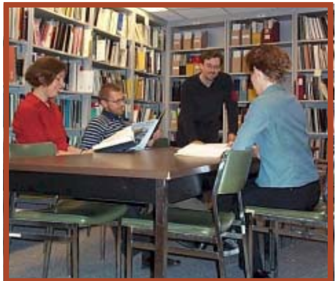
The IUS Library, 346 Portage Avenue