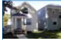
University of Winnipeg Student Residences