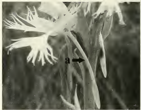
FIG. 2. Platanthera praecleara flower, lateral view, showing nectar spur (a).

The potential pollinators for P. praecleara in Manitoba are not known. Although the literature suggests that night-flying members of the Sphingidae may be key pollinators of P. praecleara , other members of this orchid genus and several closely related genera may be pollinated by butterflies, other moth species, certain Diptera, Coleoptera or Hymenoptera (van der Pijl &