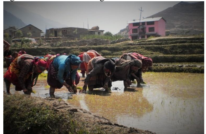
"Pests and diseases", particularly rice blast, was the number one cited causal factor of food habit changes

Of all of the factors contributing tofood habit changes reported during the FGDs, the most commonly cited was the impact of pests and diseases on local food production. While this included reported locust outbreaks, unknown pests, and smut disease on wheat, the vast majority of respondents referred to blast disease in rice. As illustrated in Table 3, "pests and diseases" was listed as a majorcausal factor of change in all of the FGDs and was also cited the most frequently (in addition to issues of climate change) throughout the FGDs. The blast problem in local rice was cited (in the Chandannath FGD, illustrated in Figure 6), as beginning in 1998 and corresponded with increased deliveries of food aid to the region. While pests and diseases are common in a variety of crops, rice blastwas reported to be one of the primary reasons why people do not produce more local rice today (due to the production risks), in addition to the high demands of labour required in rice production, particularly with the district being organic. In fact the few cases in which people suggested that there may still be use of agricultural chemicals in Jumla, was in reference to "Butachlor", used as an herbicide in rice fields. The frequency in which pests and diseases were cited as causal factors of changing food habits may be indicative of the significance of rice as a staple crop. Both crop and genetic diversity have been used to alleviate these issues in rice production.