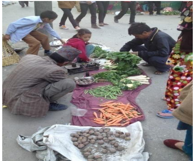
Availability of white rice has replaced consumption of traditional cereals/grains

Figure 3: People Purchasing Vegetables from the Market in the Chandannath Bazaar