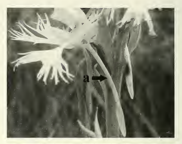
FIG. 2. Platanthera praeclara flower, lateral view, showing nectar spur (a).

The potential pollinators for P. praeclara in Manitoba are not known. Although the literature suggests that night-flying members of the Sphingidae may be key pollinators of P. praeclara , other members of this orchid genus and several closely related genera may be pollinated by butterflies, other moth species, certain Diptera, Coleoptera or Hymenoptera (van der Pijl &