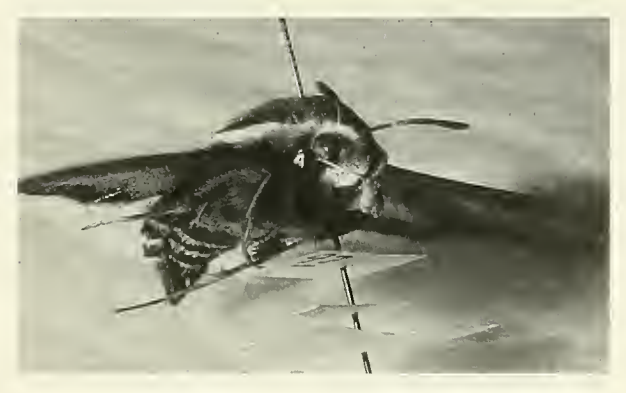
FIG. 4. Anterior/lateral view, Hyles gallii (Rottenburg), with pollinia from Platanthera praeclara attached to eyes. Note the large viscidium cemented to lower-center of eye, with massulae projected forward.